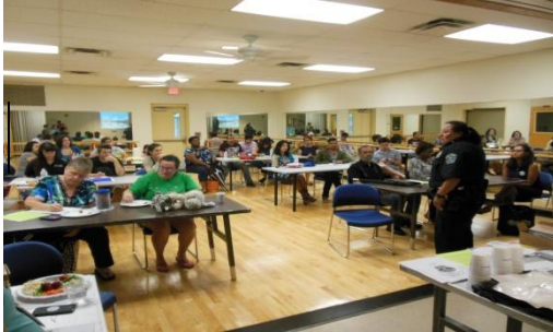
Left: 78744 Residents Gather at the Dove Springs Rec Center for the 2nd part of Neighborhood Watch training