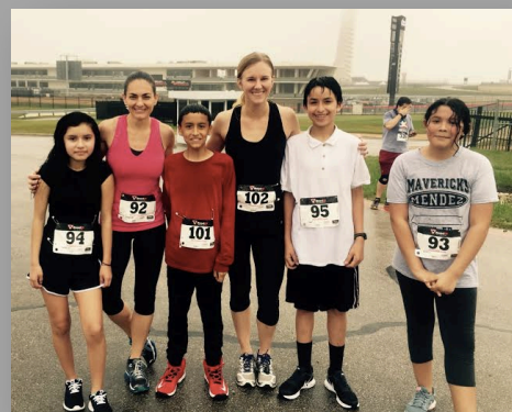
Mendez Middle School Running Club

Studies show that children who watch an hour of television or more a day are more likely to be overweight or obese than those who spend this time doing other activities. Try spending that hour taking a walk with the family this week! This is an on-going study sponsored by the National Center for Education Statistics (NCES).