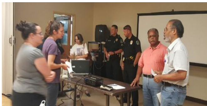
Above: Part three of the neighborhood watch training in 78744