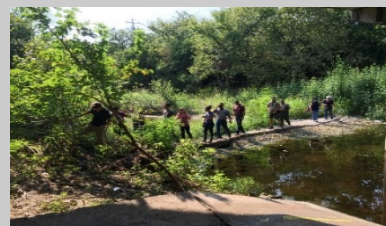
Photo: Connect Garrison community hike